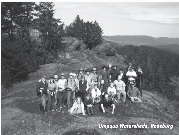
Umpqua Watersheds, Roseburg

Beyond Toxics Eugene Cascadia Wildlands Eugene Crag Law Center Portland Umpqua Watersheds Roseburg