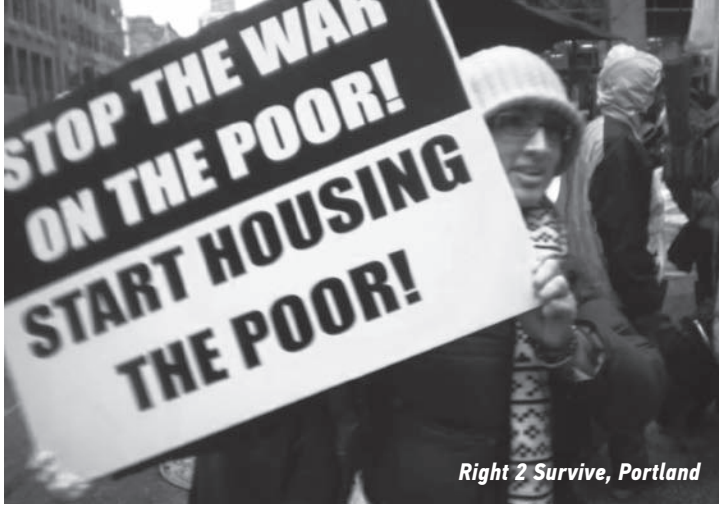
Right 2 Survive, Portland