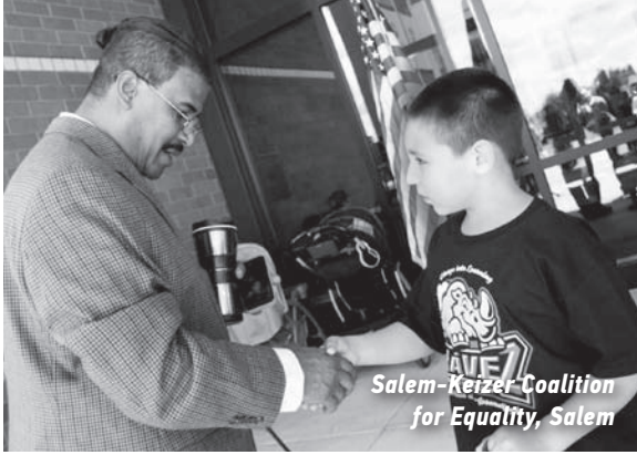
Salem-Keizer Coalition for Equality, Salem