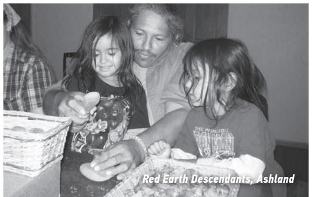
Red Earth Descendants, Ashland