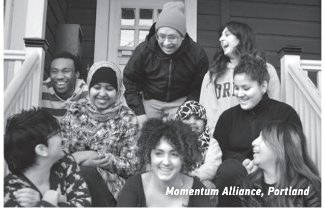
Momentum Alliance, Portland

► MRG is bringing 36 years of knowledge and experience to expand social justice grantmaking in our region: As part of our 3-year strategic plan, MRG is committed to growing and sustaining powerful leaders for social change, and helping local foundations to see the value of funding grassroots organizing.