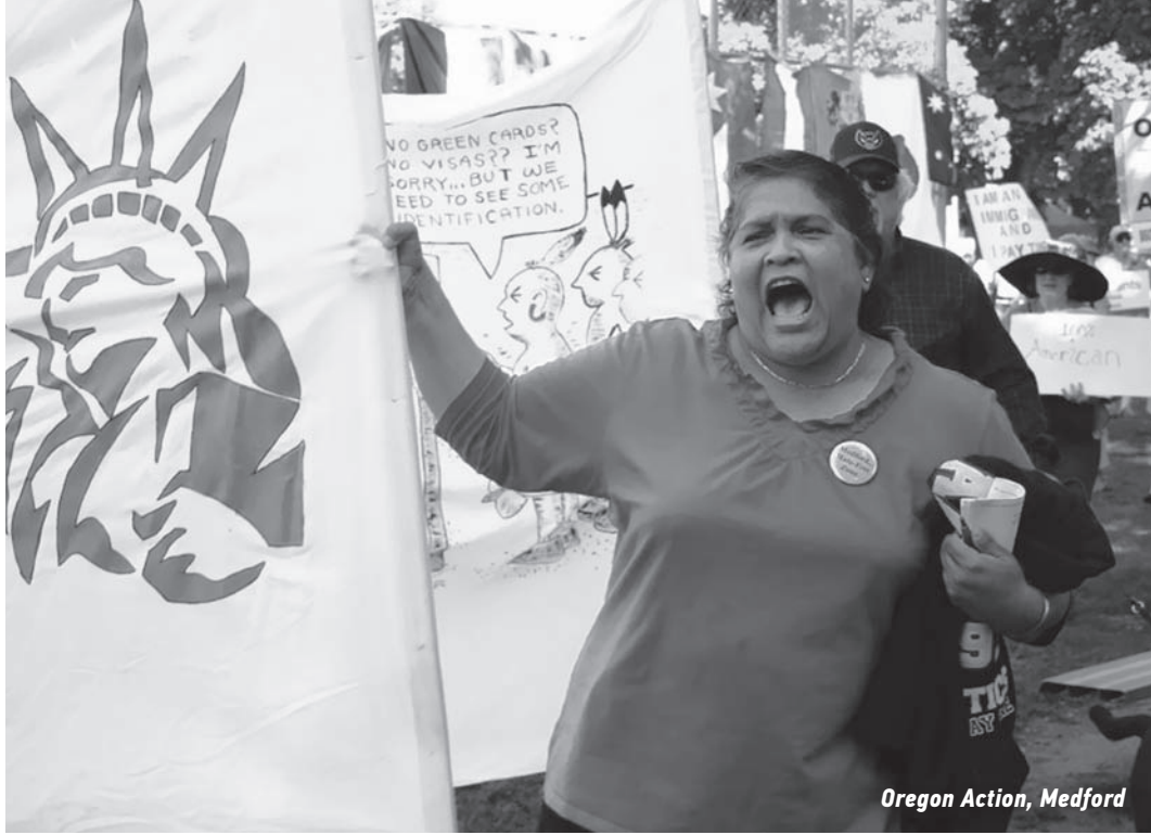
Oregon Action, Medford